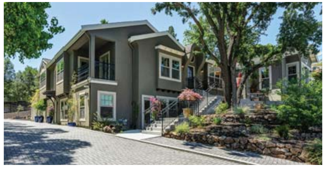
1581 Huston Rd, Lafayette